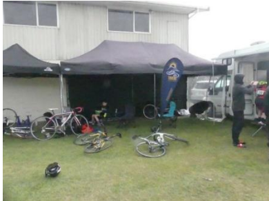
Southland Secondary School Cycling Championships were held in September.