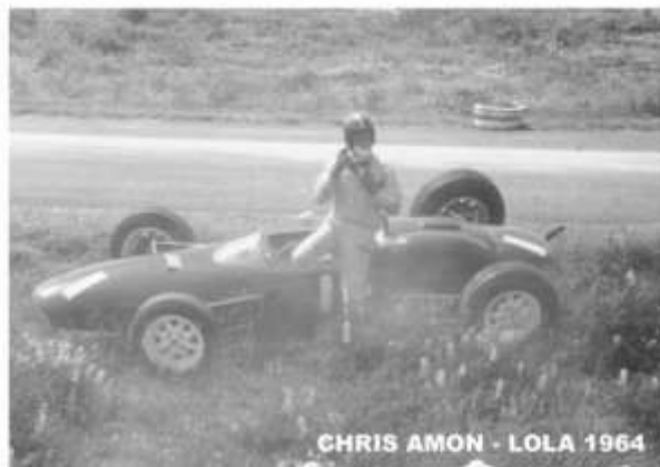
CHRIS AMON - LOLA 1964